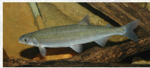
Australian grayling, a threatened native fish.

Environmental flows are actively delivered in the Latrobe, Thomson and Macalister Rivers and to wetlands including the Lower Latrobe Wetlands: